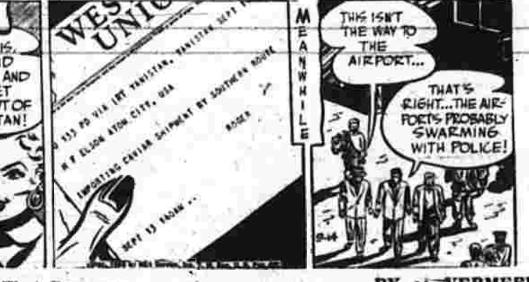
MICKIEY FINN BY LESLIE TURNER