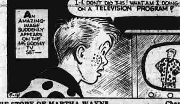
CHANCE FOR RESCUE? BY WILSON SCRUGGS