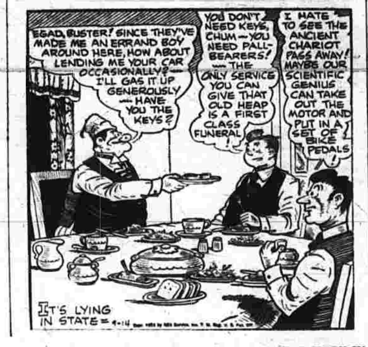
AWFUL PLIGHT BY V. T. HAMLIN