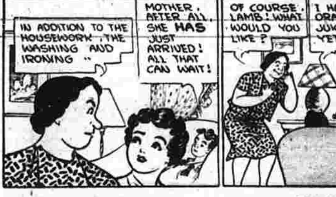
THE IMPOSSIBLE! BY MERRILL C. BLOSSER