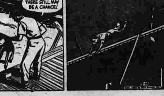
NEW BATSMEN BY WILSON SCRUGGS