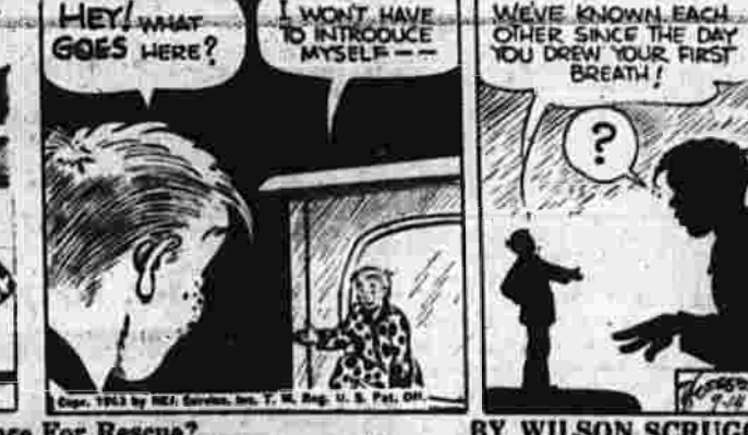
NEW BATSMEN BY WILSON SCRUGGS